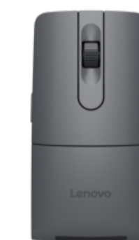
ThinkPad Bluetooth Presenter Mouse (Aura Edition) 4Y51T62792