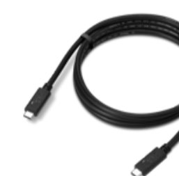
Lenovo USB 20Gbps USB-C to USB-C Cable 1.5m 4X91U92143