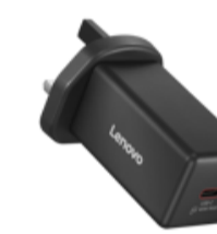
Lenovo 65W Mini USB-C GaN Charger GOA665WBUK