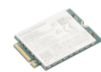
ThinkPad Rolling Wireless RW101R-GL SDX12 4G USB M.2 3042 module for CS2627 4XC1V64418