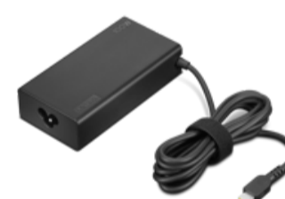
Lenovo USB-C 100W AC Adapter-DK GX21V60487