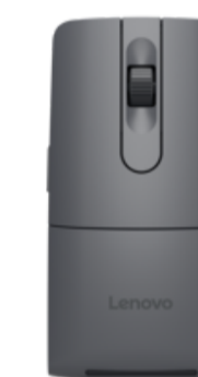
ThinkPad Bluetooth Presenter Mouse (Aura Edition) 4Y51T62792