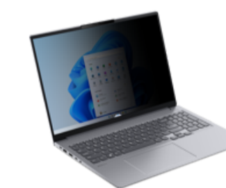
Lenovo 16" Clarity Privacy Filter 4XJ1U03940