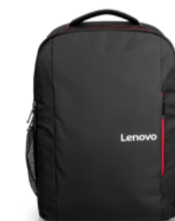
Lenovo 16" Laptop Everyday Backpack B510 4X41U80414