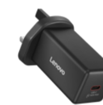
Lenovo 65W Mini USB-C GaN Charger GOA665WBUK