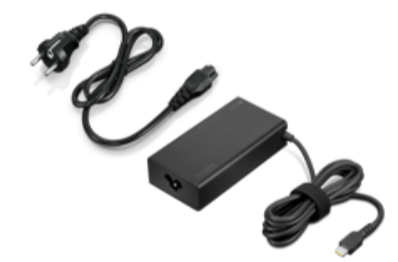
Lenovo USB-C 100W AC Adapter-UK GX21V60490