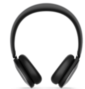
ThinkPad Dual-Mode Wireless ANC Foldable Headset 8550 (Aura Edition) - USB-A, ... 4XD1V23301