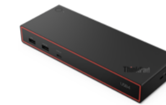
ThinkPad USB4 Dock 5000 (with 135W Adapter) 40BF0135UK